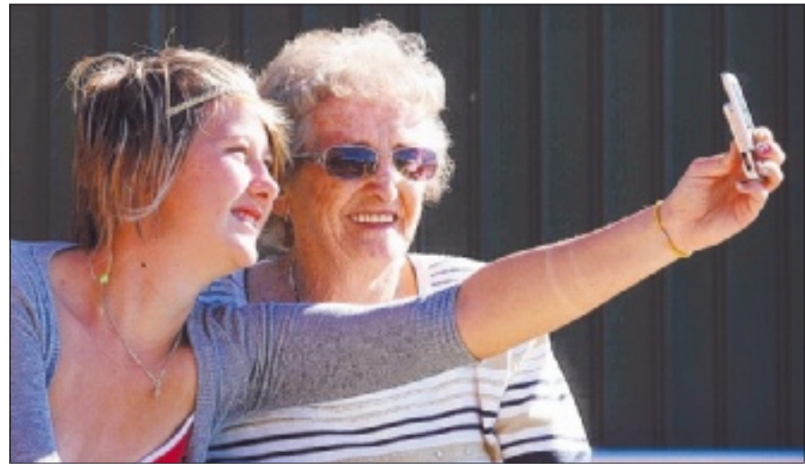
It's one of those places where the neighbours are friendly with each other and everyone lends a hand

men. In 2020, women are expected to live until they are 85, while men will live to approximately 80. This is expected to have a major impact on health, work and housing over the next few decades.